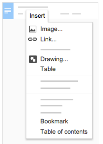
Image Insert an image from your computer, the web, or Google Drive.

Enhance your document by adding features.